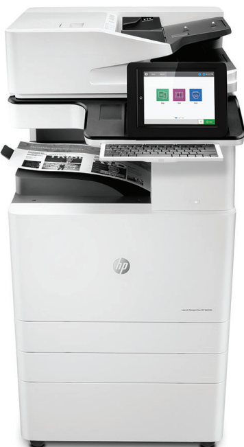
HP LaserJet Managed Flow MFP E82550z