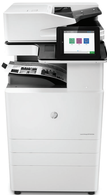
HP LaserJet Managed MFP E82550dn

Businesses that stay ahead don't slow down. It's why HP built the next generation of HP LaserJet MFPs—to power productivity with a streamlined design that delivers premium quality, maximum uptime, and the strongest security. 1